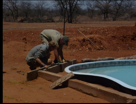
Starting work on the finishing touches.....