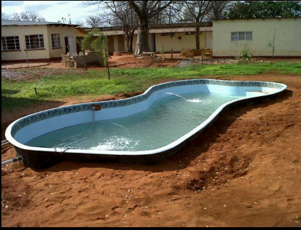
Water going in.....